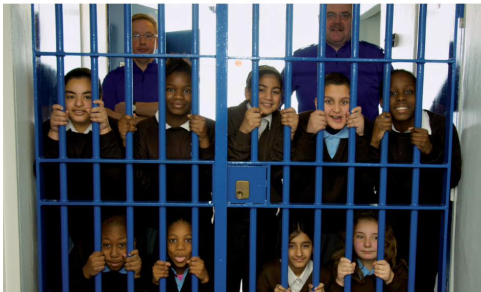
St Clare's Children, happily, behind bars ?

PUPILS from St Clare's Catholic Primary have become the first to visit cells at Handsworth police station as part of a crime prevention initiative launched by the Lozells and East Handsworth neighbourhood policing team.